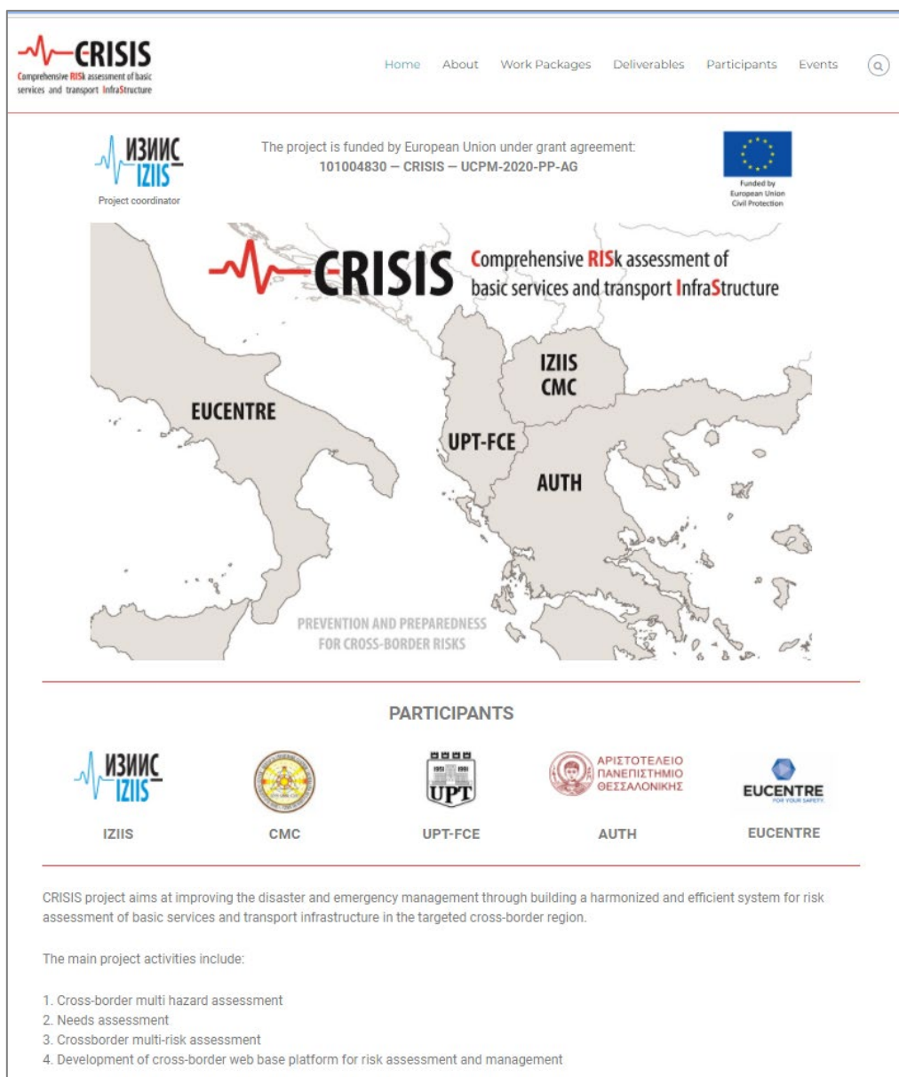
Figure 1. CRISIS web page (Home menu)

It serves as a central point for information about the project. The design was developed based on the CRISIS logo and is in keeping with the overall visual identity of the project. The structure was conceived to minimise the number of clicks needed to reach key information. In terms of content, the aim is to provide frequent updates to the site with information that is up to date, relevant, trustworthy and written in an accessible language (i.e. excluding project specific references to ‘work packages’ or ‘deliverables’).